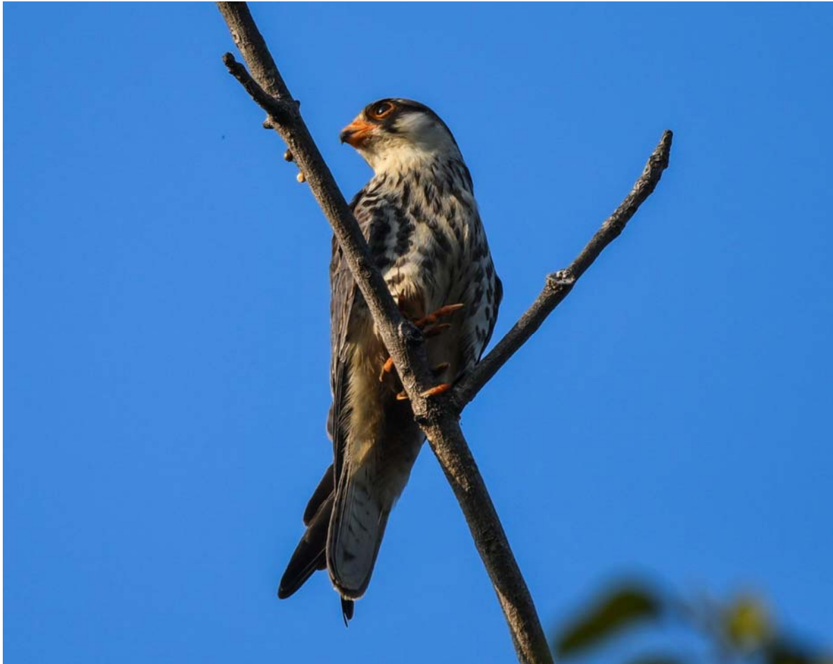
Amur Falcon, Yishun Dam, 16 Dec 2016

A total of 36 Black Bazas were recorded on the northern areas from Sungei Buloh to Pasir Ris, the largest flock being 15-strong at Punggol Barat. For the Oriental Honey Buzzard , 45 were recorded, the largest flock comprised 11 birds at Sungei Buloh on the 3rd, probably on migration. On the 15th, there was a sight report of a juvenile Rufous-bellied Hawk-Eagle, which cannot be verified due to the possibility of confusion with other similar-looking species.