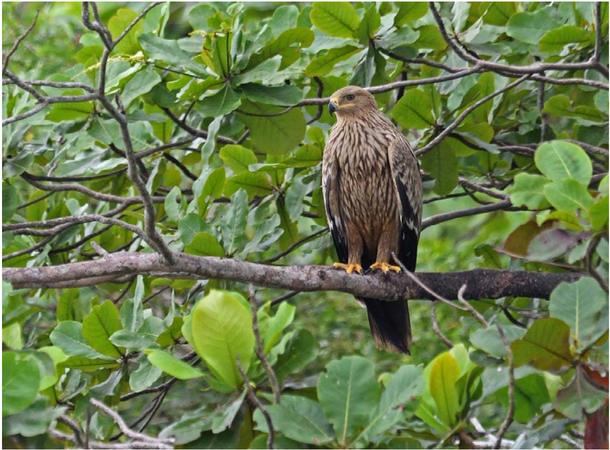
Eastern Imperial Eagle, juvenile, Pulau Ubin, 28 Dec 2016, by Frankie Cheong