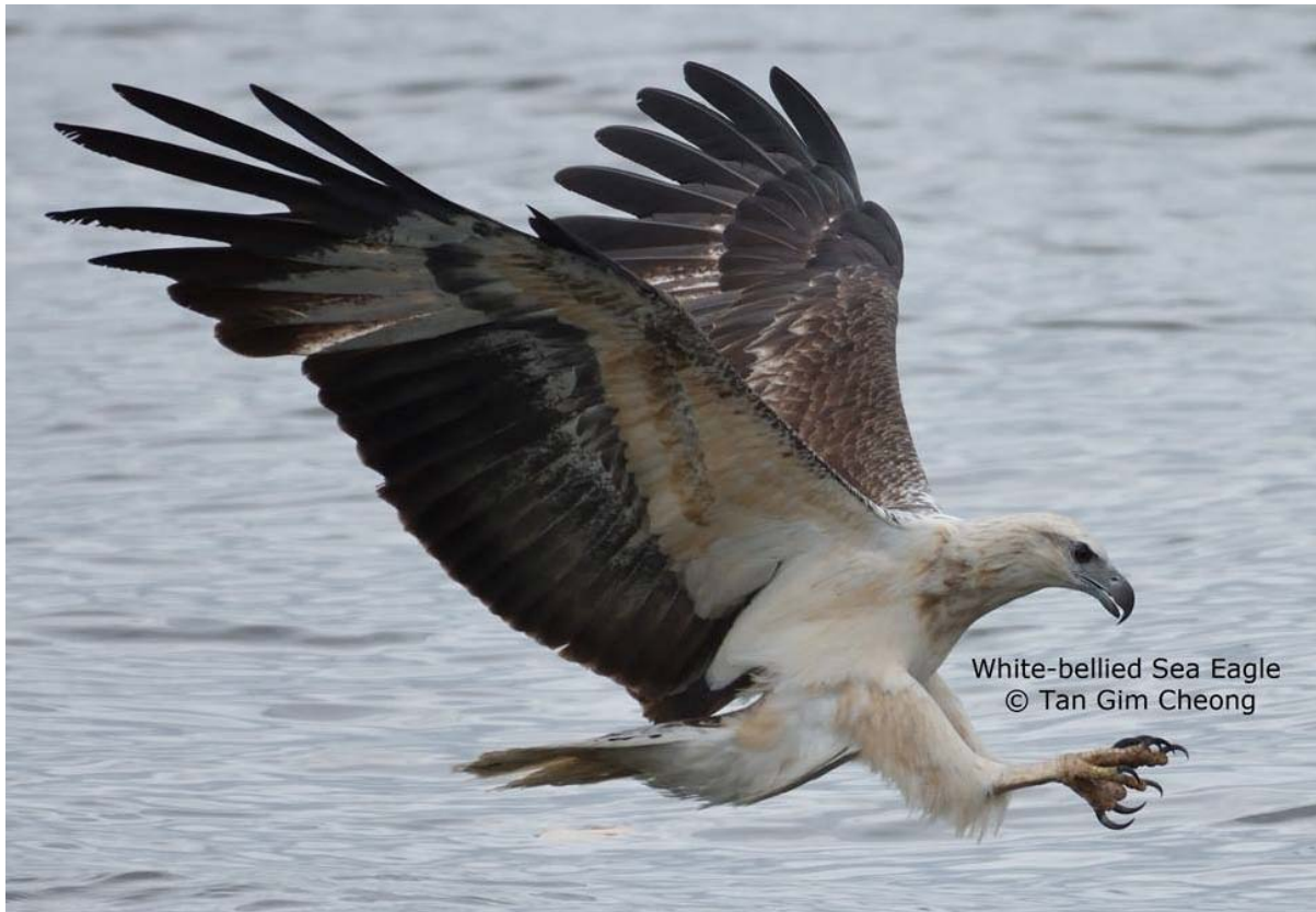
White-bellied Sea Eagle, immature, Pulau Ubin, 27 Dec 2016